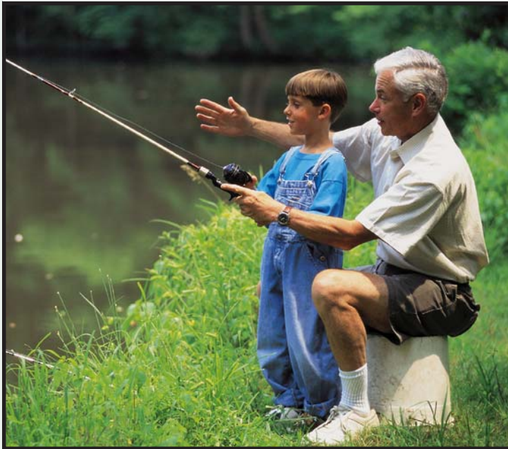
Quantum Nutritional Support for exhausted or stressed adrenal glands*

“Stressed? Exhausted? In our fast paced lives, stress can lead to increased illness, and rapid aging. Protect yourself with Quantum Adrenal Complex, featuring grade 10 cordyceps, the best for anti- stress and long life.”