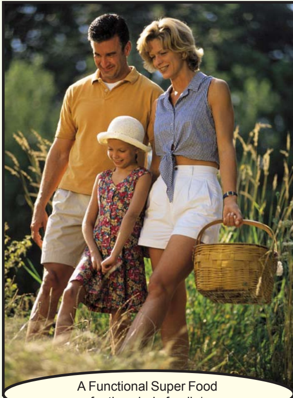
A Functional Super Food for the whole family*

Medi-Aminos is a pure Functional Super Food beverage powder concentrate, derived from steam-proteinated (a unique proprietary process), “beyond organic”, nonhybrid whole foods, grown in the Far East where no chemicals or pesticides have ever been used (completely pesticide-free).